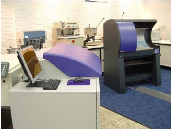
A modern CTP system. Plates are now made without using film.

The company has been supplying pre-press equipment for over 80 years. Today we offer the latest Computer-to-Plate systems as well as traditional computer-to film devices.