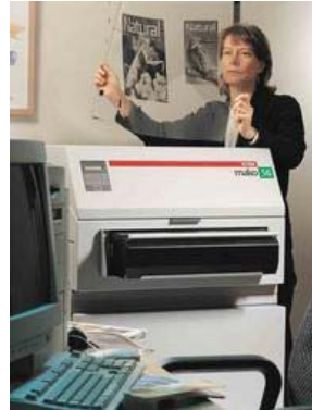
Intermediate technology – a Film Imagesetter. New or used models are available.