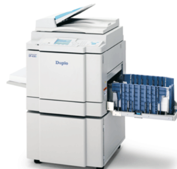
A digital duplicator provides reliable and cheap printing for documents and booklets