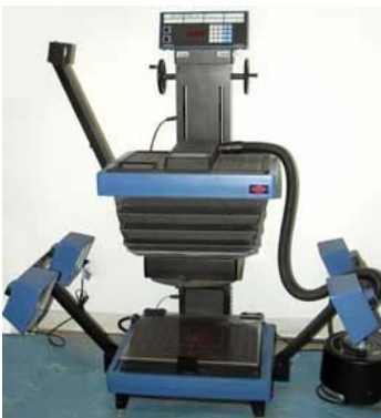
An obsolete Repro Camera – though film for it is still available

Hunter Penrose provides installation, training and back-up services including consumables supply throughout Africa and the Middle East.