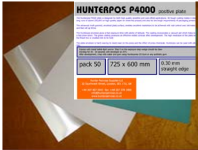
HUNTERPOS positive offset plates

Hunter Penrose offers a wide choice of materials in both innovative and traditional technologies, from world names such as KODAK, as well as our own HUNTERPRESS brand.