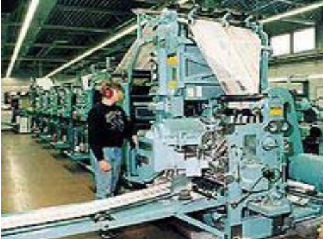
Used Goss newspaper presses are exported all over the world

We supply new and used equipment for all kinds of offset printing and finishing as well as digital proofing, digital duplicating, and other types of digital printing.