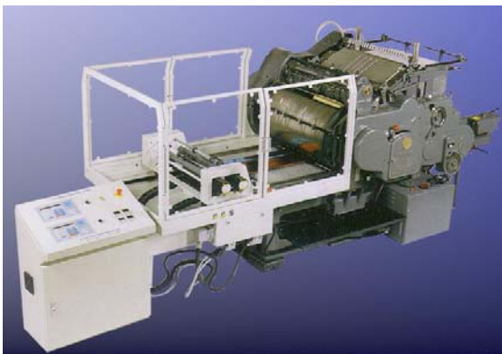
Metallic Foil is applied using this hot-stamping conversion to a Heidelberg cylinder press

When recommending equipment, we first discuss with our customers the local working environment and specific requirements, including compatibility with any existing systems.