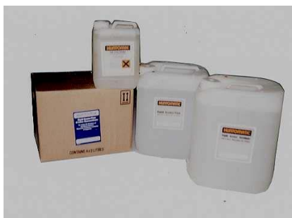
HUNTERPRESS Chemicals for film and plate processing

Like almost all aspects of printing, the production of plates for offset litho is today in a state of evolution between different technologies.