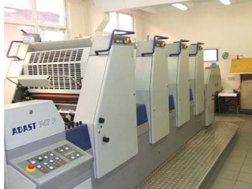
A new 4-colour sheet-fed offset press

Hunter Penrose has developed close working partnerships with reputable European manufacturers of high quality printing machinery. New presses are installed by the manufacturers, and the engineers provide training and back-up service. We ensure that every machine is guaranteed and we only choose manufacturers who have a proven record of reliable service.