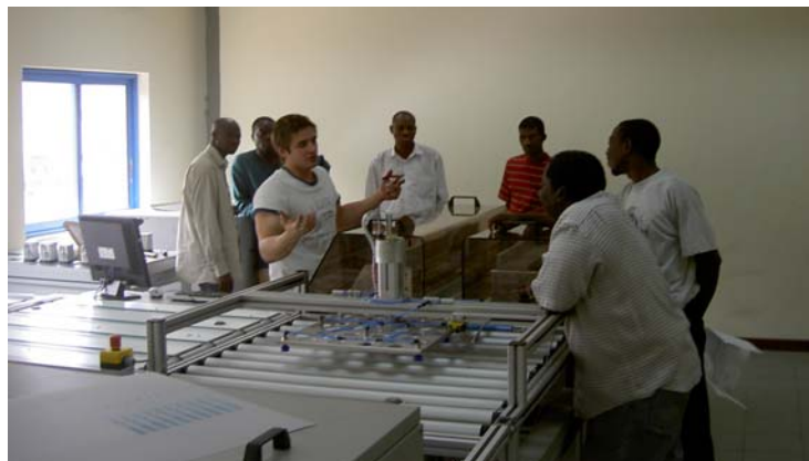
Training on a newly installed Beil Automatic Plate-Punch