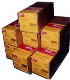
Kodak GEN5 GRD Immaesettina Film